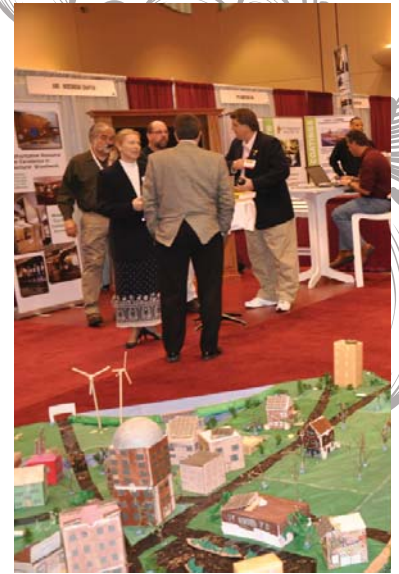
Architects in Schools "Design Your School" Competition and Terrace Town Display at the AIA Wisconsin Building Products Expo