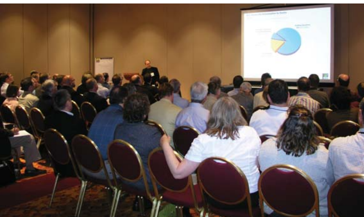
Continuing Education Sponsorship