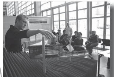
UNSEEN Architecture: MKE on display at AIA HQ in Washington, DC